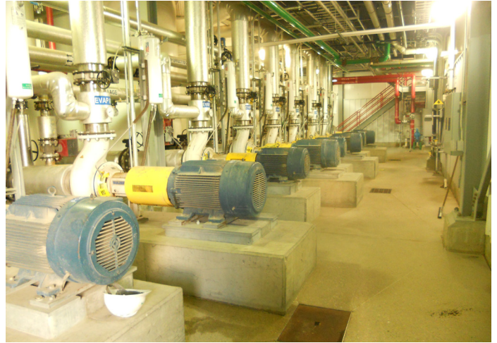
The plant saves around $28,000 per year through sales tax exemptions on energy that powers equipment used directly in ethanol production, such as these high-efficiency evaporator and condensate pumps.