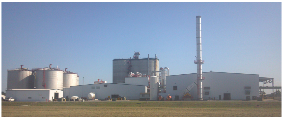
Energy Insight, Inc. helps customers like this Iowa ethanol plant avoid paying thousands of dollars per year in state and local sales taxes by analyzing how energy is used and certifying tax-exempt purposes.